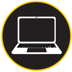
GRAPHICS/DIGITAL/ TECHNOLOGY (On rotation) 5 classes in 10 days