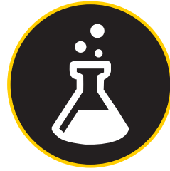
SCIENCE 8 classes in 10 days