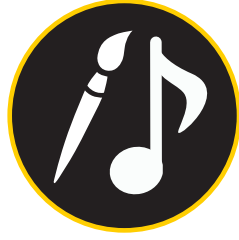
ART/DRAMA/ MUSIC (On rotation) 5 classes in 10 days