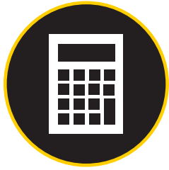
MATHEMATICS 8 classes in 10 days

The Year 9 programme consists of 30 periods (classes) per week = 60 lessons over a 10 timetable cycle. The courses are: