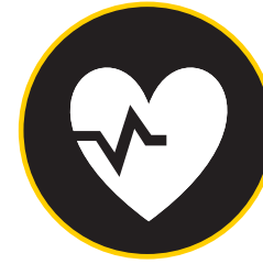
PE AND HEALTH 6 classes in 10 days