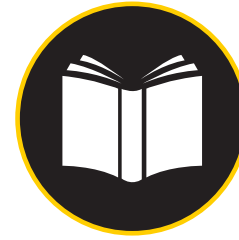
ENGLISH 7 classes in 10 days