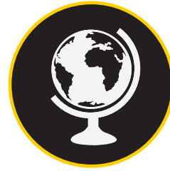
SOCIAL STUDIES 8 classes in 10 days