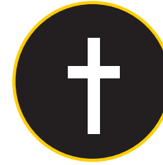
RELIGIOUS EDUCATION 3 classes in 10 days